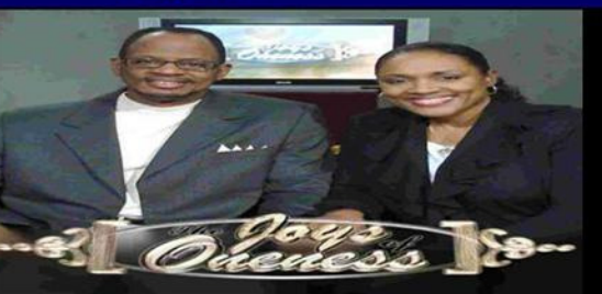
Joy of Oneness