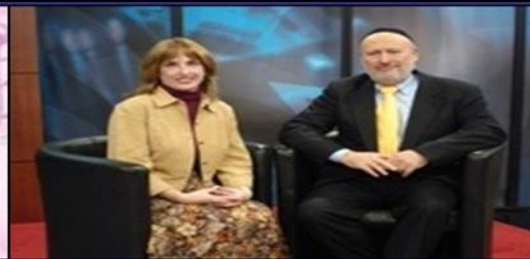
Ancient Jewish Wisdom