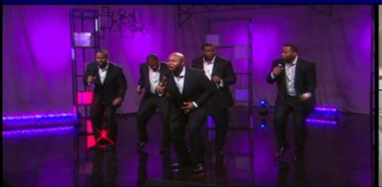
Gospel Music: Sessions