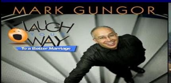
Love Marriage & Stinkin Thinkin