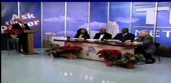
Ask The Pastor