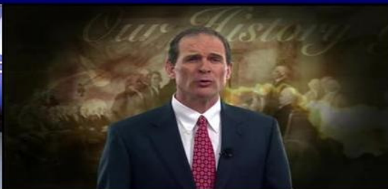
Faith In History