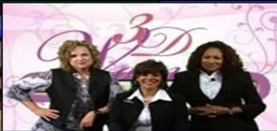
3 D Women