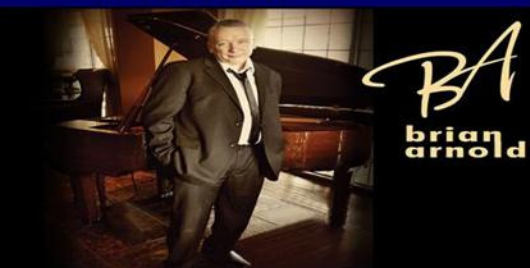
Victim To Victory

Here are a few of the 150 programmers we carry on Body Builders Television Network